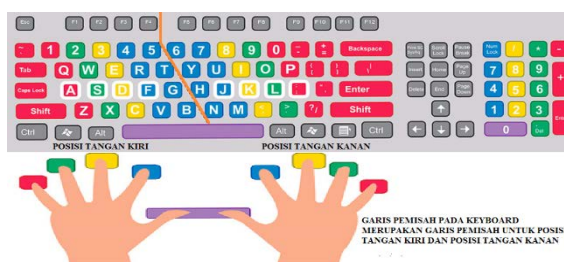
Figure 1. Typing Skills

The development of information and communication technology becomes the challenge of educational institutions especially vocational high school to be able to produce graduates who master the knowledge and skills related directly to office work. One of the skills that must be owned by graduates majoring in automatic expertise program and office governance is typing skills.